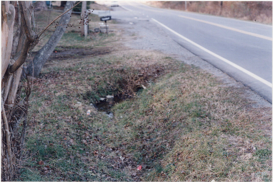
Photograph 13. The drainage ditch located on the west side of Scientific Street that flows towards the intermittent stream at the entrance to the site.