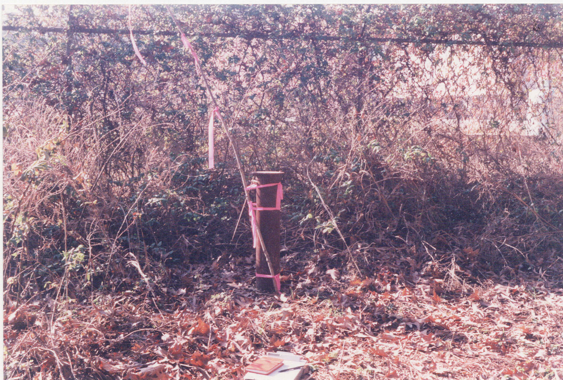
Photograph 4. Monitoring well # 2 located north of concrete lined lagoon.