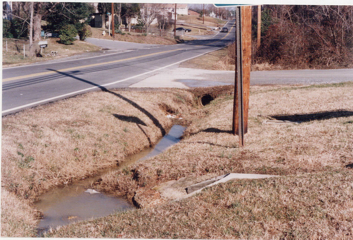
Photograph 12. The intermittent stream located adjacent to the site parallel to Scientific Street.