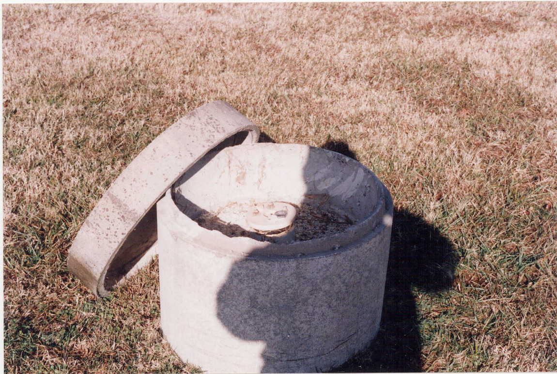
Photograph 5. Monitoring well #5 located west of the old Monarch Furniture building.