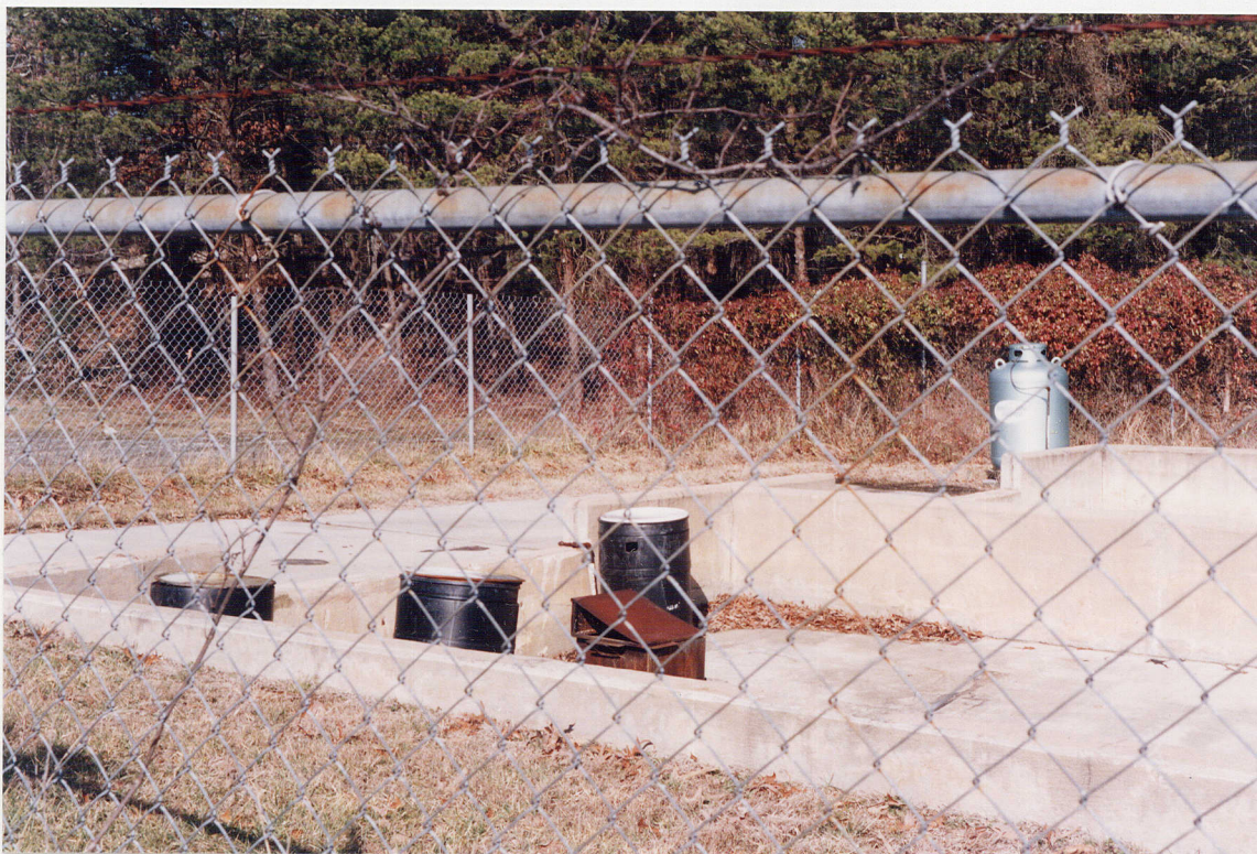
Photograph 8. Drums located in the sludge drying ponds at the northeast corner of the site.