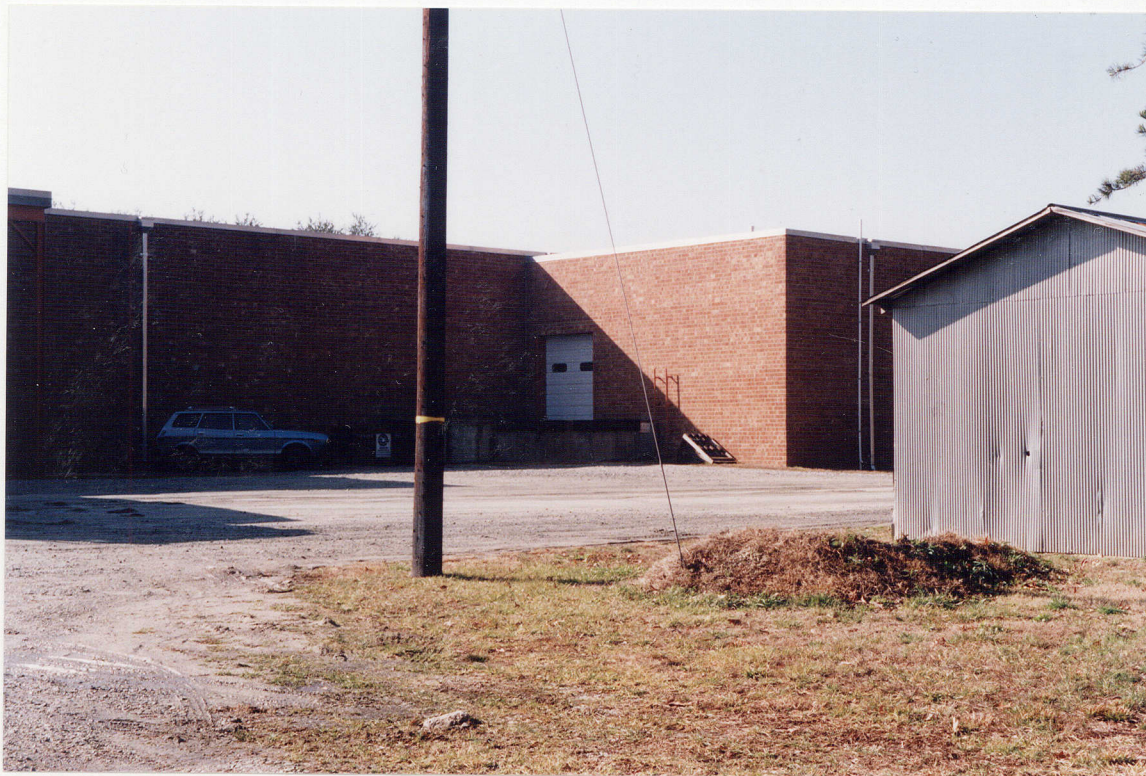
Photograph 3. North side of Monarch Furniture building at loading dock area.