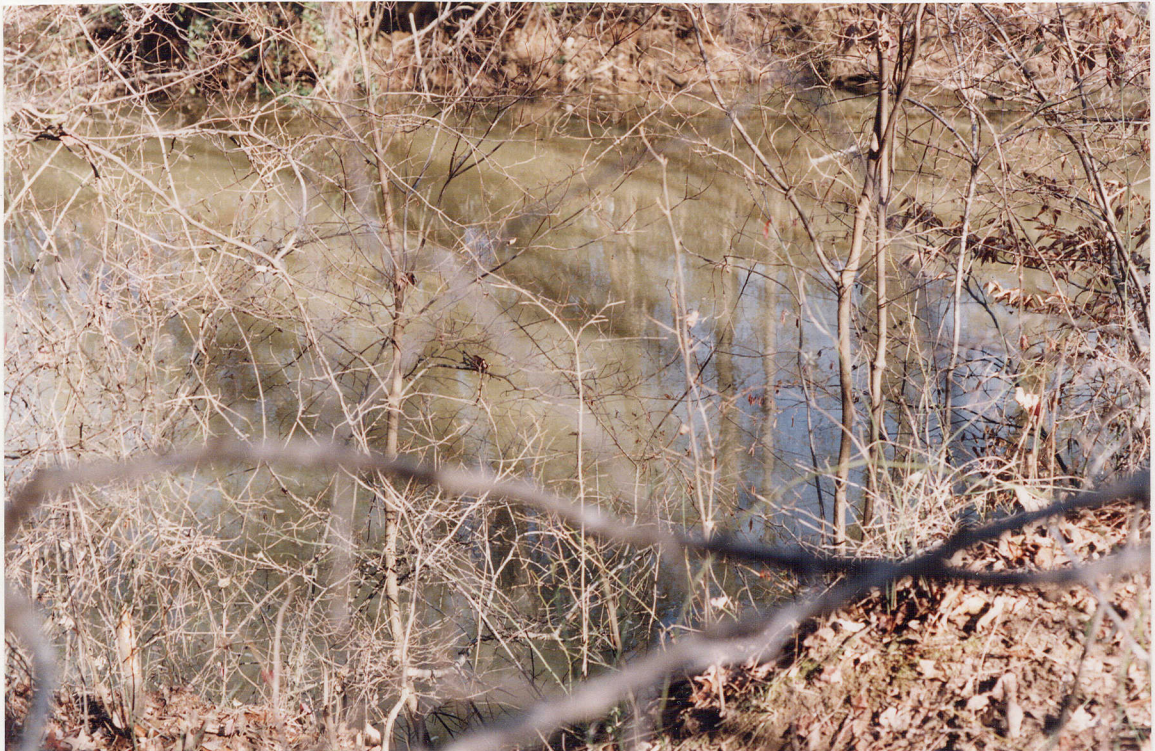
Photograph 14. The upstream sample location in the Deep River.

K&M Division POLY-VUL Torrance, CA 90503 # PV119