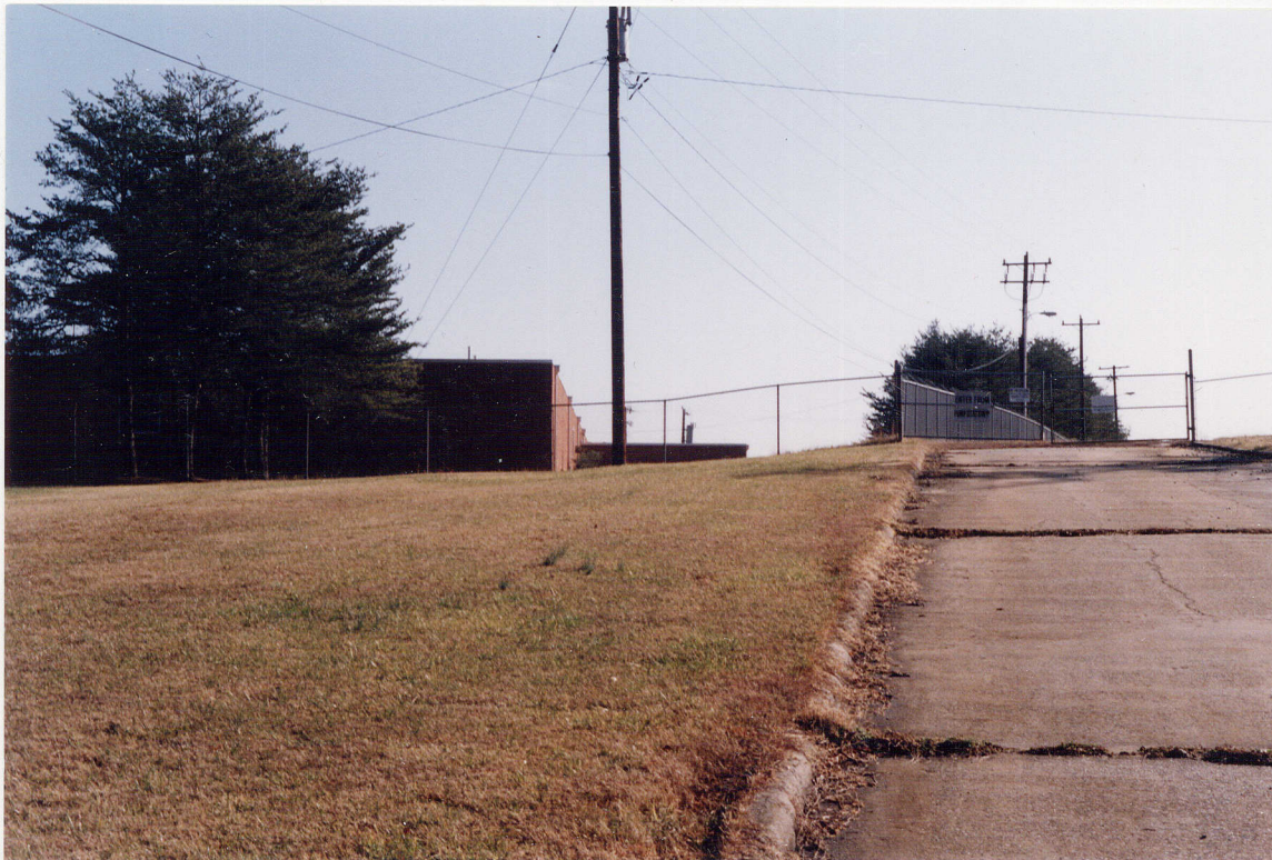
Photograph 1. View of site building from Scientific Street, Thomasville Furniture Property to the right.