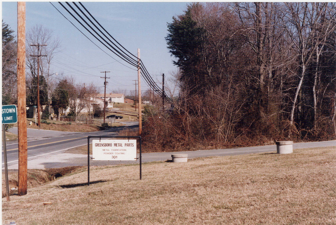
Photograph 6. Well #5 and sewer manhole located at west side of site (presently Greensboro Metal parts).

K&M Division POLY 1001 Irrance, CA 90503 # PV119