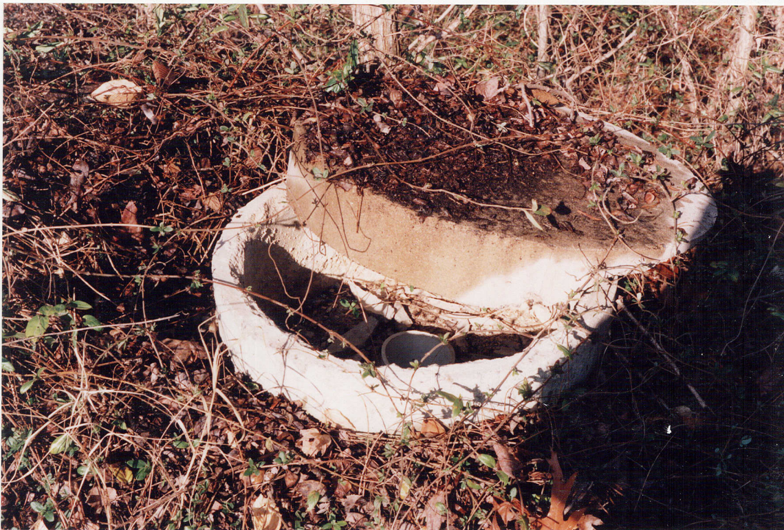
Photograph 7. Monitoring well #4 located at the north end of the gravel driveway. No locking cap on wellhead.