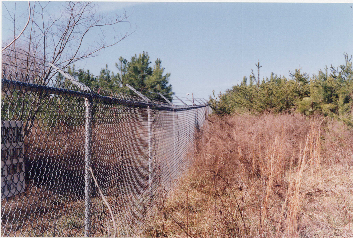
Photograph 10. The sludge field overgrown with tall grass and pine trees located near Thomasville Furniture Company.

K&M Division POLY Torrance, CA 90503 # PV119