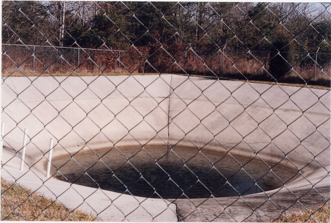
Photograph 9. The 13-foot deep concrete lined lagoon located at the northeastern corner of the site.