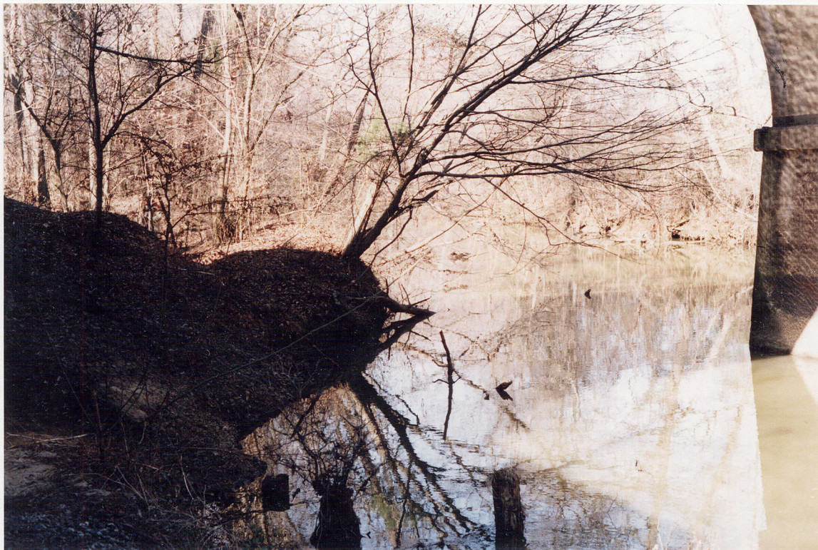
Photograph 15. The downstream sample location near the Southern Railroad overpass at the Deep River.