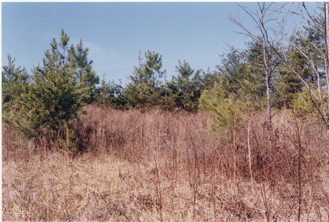
Photograph 11. The sludge field area located at the southeastern corner of the site.