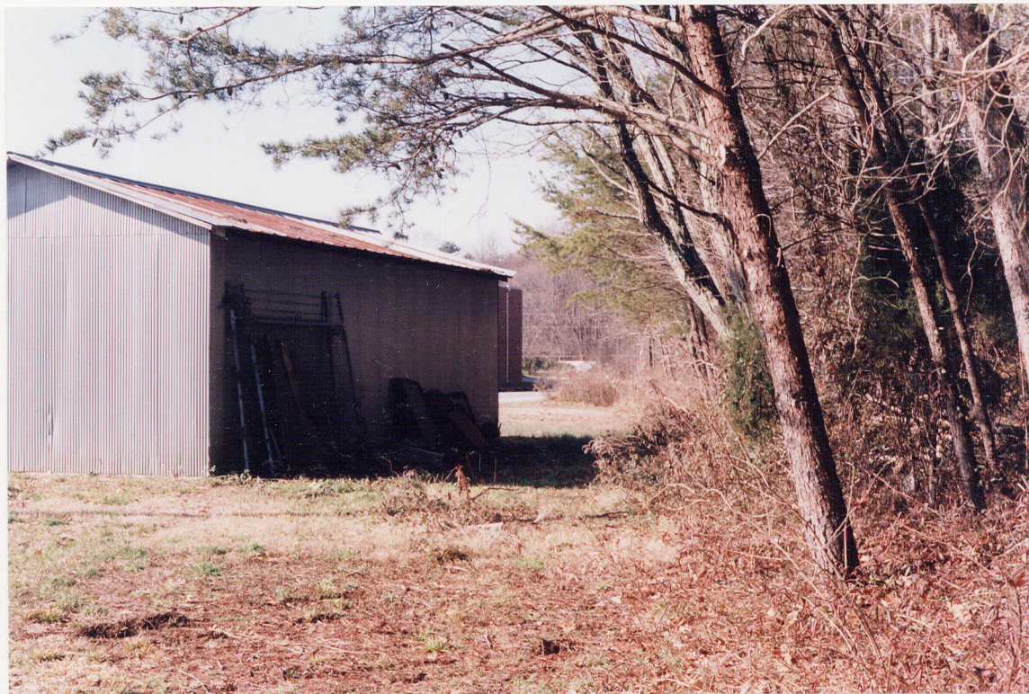
Photograph 2. North edge of property viewed from concrete lagoon.

K&M Division POLY III Torrance, CA 90503 # PV119